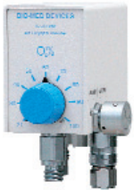
MID-FLOW with bleed switch and bottom output

To learn more, visit www.biomeddevices.com , or call the number below.