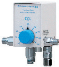
HIGH/LOW FLOW with three outputs