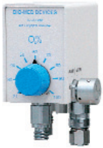
MID-FLOW with bleed switch and bottom output

To learn more, visit www.biomeddevices.com , or call the number below.