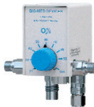
LOW FLOW with two side outputs