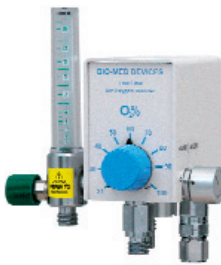
LOW FLOW with 15 lpm flowmeter, bleed switch and bottom output