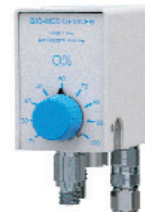
HIGH FLOW with single bottom output