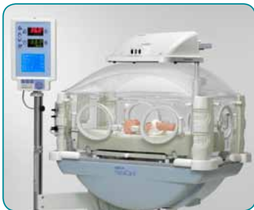
neoBLUE system positioned on an incubator

Surface area coverage: Exposes length of baby from head to toe.