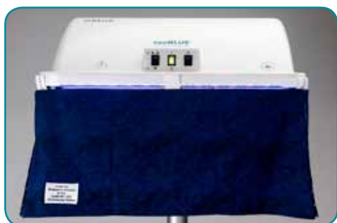
neoBLUE system shown with drape accessory

neoBLUE LEDs emit blue light in the 450-470 nm spectrum. This range corresponds to the peak absorption wavelength (458 nm) at which bilirubin is broken down.